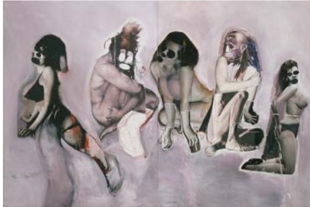
Richard Prince, James Brown Disco Ball