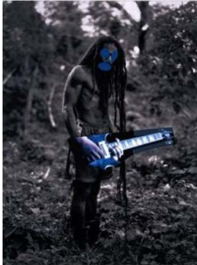
Richard Prince, Graduation

Between November 8 and December 20, 2008, the Gallery put on a show featuring twenty-two of Prince's Canal Zone artworks, and also published and sold an exhibition catalog from the show. The catalog included all of the Canal Zone artworks (including those not in the Gagosian show) except for one, as well as, among other things, photographs showing Yes Rasta photographs in Prince's studio. Prince never sought or received permission from Cariou to use his photographs.