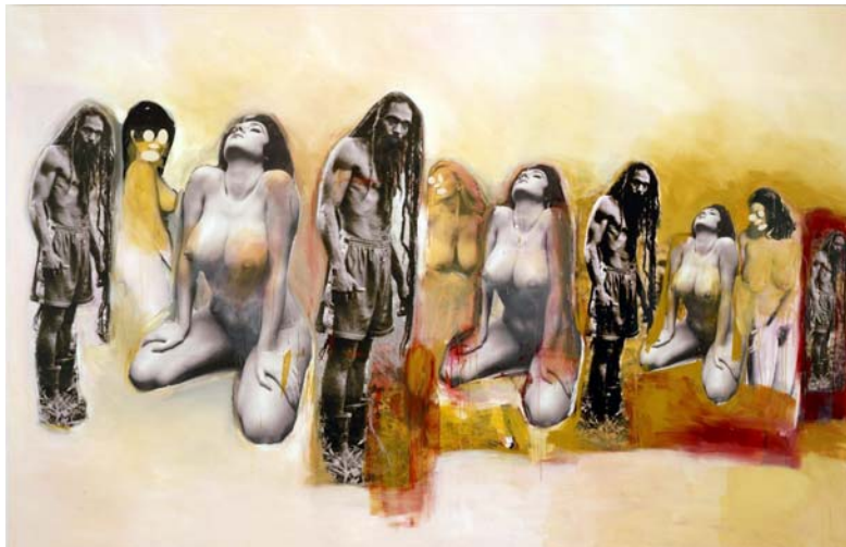
Tales of Brave Ulysses