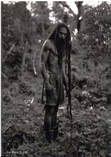
Yes Rasta , p. 118