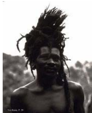
Patrick Cariou, Photographs from Yes Rasta , pp. 11, 59