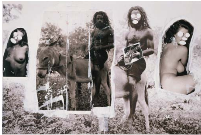
Back to the Garden