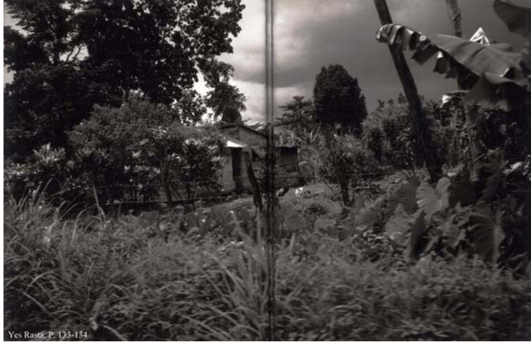
Yes Rasta, pp. 133-134