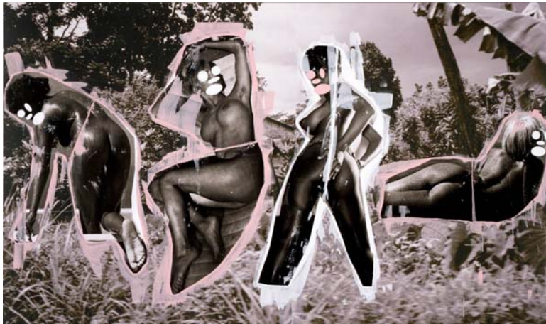
Djuana Barnes, Natalie Barney, Renee Vivien and Romaine Brooks take over the Guanahani