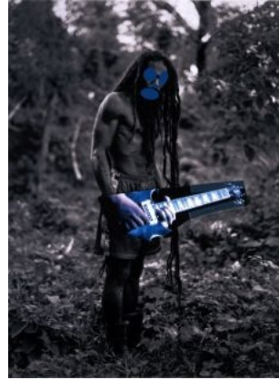
Richard Prince, Graduation

3 Between November 8 and December 20, 2008, the Gallery put on a show featuring 4 twenty-two of Prince’s Canal Zone artworks, and also published and sold an exhibition catalog 5 from the show. The catalog included all of the Canal Zone artworks (including those not in the 6 Gagosian show) except for one, as well as, among other things, photographs showing Yes 7 Rasta photographs in Prince’s studio. Prince never sought or received permission from Cariou to 8 use his photographs.